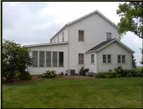
East side of the home. Sunroom on left.