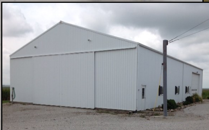
60'x104' FBI pole building constructed in 2000 with heated shop, office, and restroom.