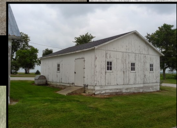
Back of garage.