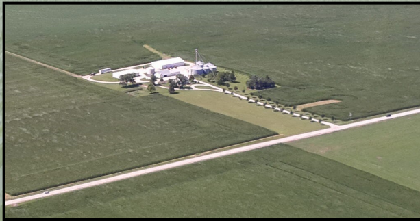
Wylie farmstead viewed from the northeast.