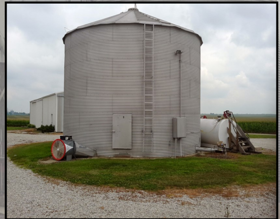
Separate 27' d 9000 bu. bin