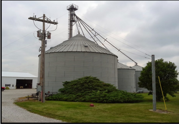
48' d bin viewed from the north. Underground electrical feed and distribution.