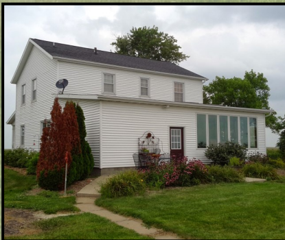
Rear entrance to dwelling.