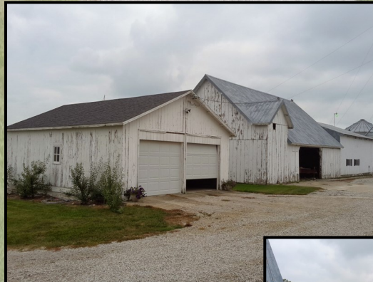
Detached two car garage and storage shed