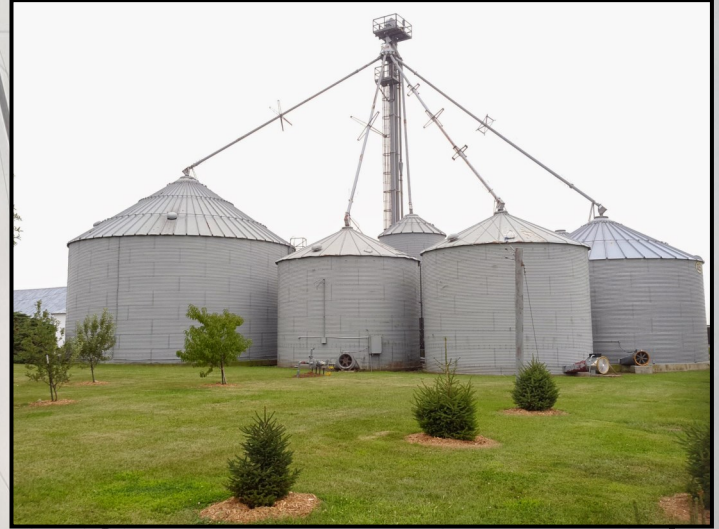
Grain complex featuring 90,000 bushel grain storage and 80 ft. leg.