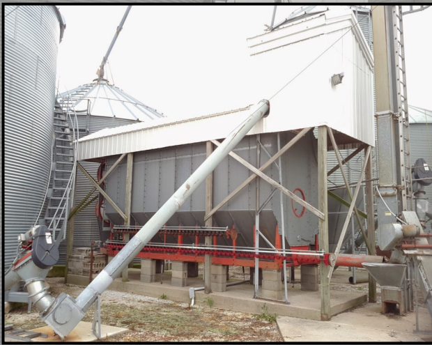
500 bushel batch dryer