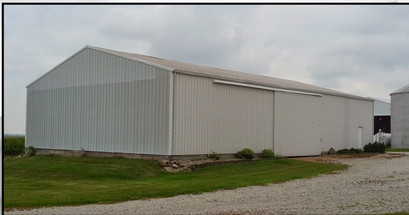
SE machine shed 52'x80' pole building with 24'x14' sliding end door and 19' w side door.