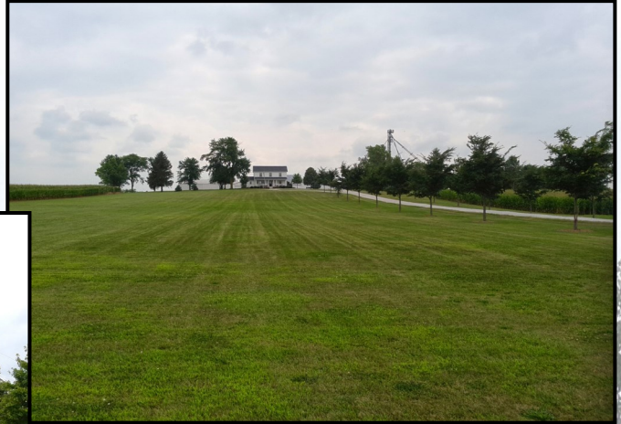
Expansive lawn and tree-lined lane leading to the Wylie farmstead.