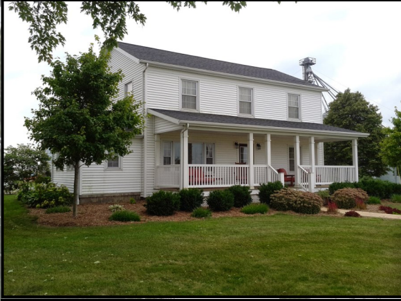
Traditional farm home featuring many updates, beautiful landscaping, and large front porch.