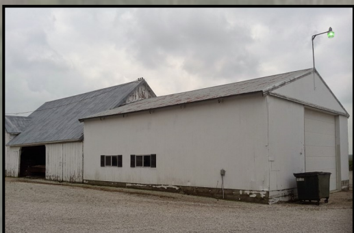
Storage shed and old shop.